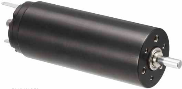
FAULHABER DC Micromotor 2668 CR

Assume that it is necessary to determine the power of which a particular motor, 2668W024CR is expected to deliver at cold operation with a torque load of 68 mNm at a speed of 7 370 min -1 . The product of the torque, speed, and the appropriate conversion factor is shown below.